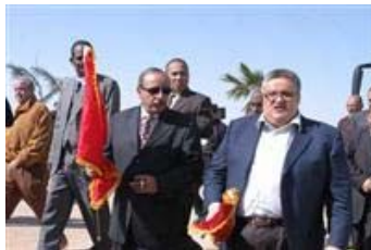
Jordan's Shaheed Group at the site of a $2 billion Serrenia resort project near Hurghada.