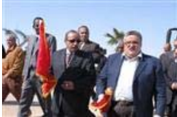
Jordan's Shaheed Group at the site of a $2 billion Serrenia resort project near Hurgada

About The Daily Star Egypt | About EMS Ltd. | Subscribe | Advertising | Contact us | Letter to editor